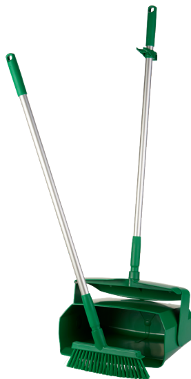
Dustpan set, closable with broom, 350 mm. Medium

This Dustpan Set can stand when closed or open.