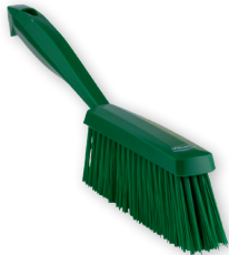
Medium bench brush