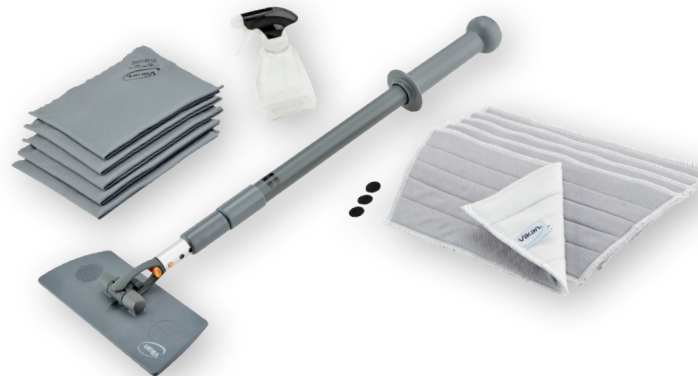
Easyshine Kit with Flexible Mop Frame

To clean tables, counters, perspex screens, display counters.