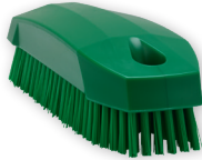
Nailbrush, 130 mm, Hard

Ultra Hygienic Handle 1500 mm Item number: 29622