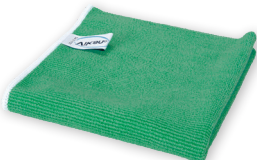
Original Microfibre cloth, 32 x 32 cm